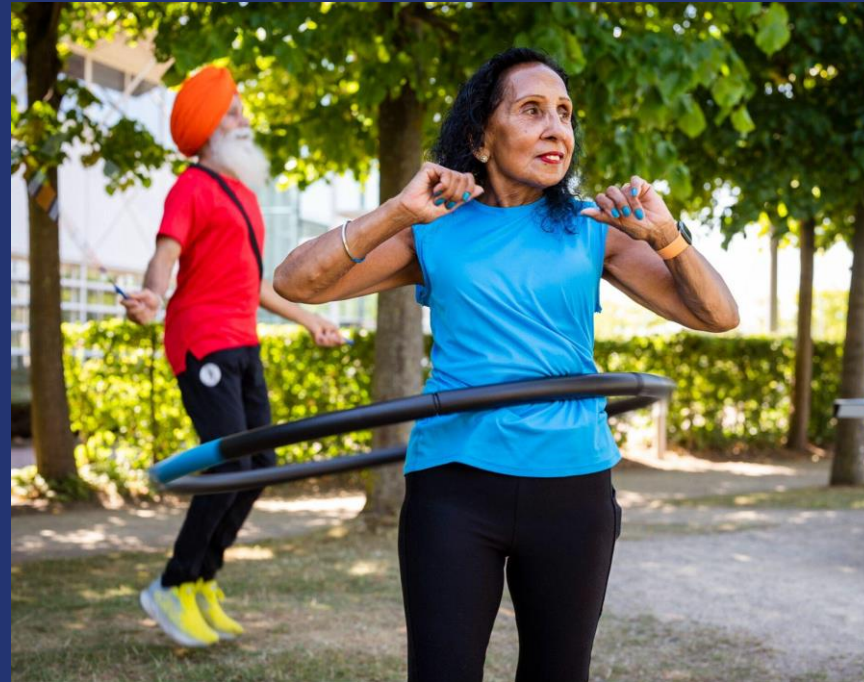
Ageing Better. (2022). Age Positive Image Library [Online]

How do we use data insights better to improve social care for people using it and people providing it?