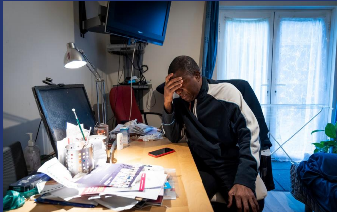
Care Home Manager

It's often 48 hours before the notes come over, we've no idea of the medication updates - it's unsafe practice.