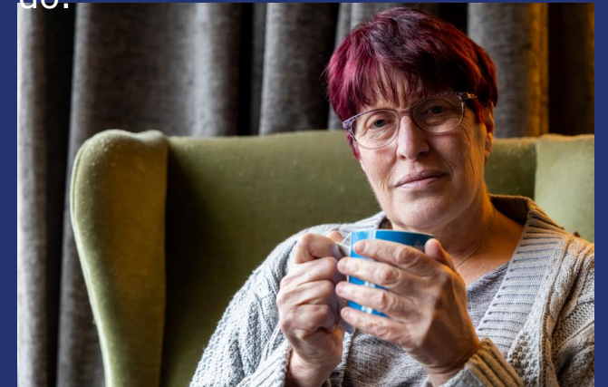
Daughter of care home resident

Once mum left the care home we had no idea what was going on. She was moved 3 times in one week and we had to search the wards for her. They don't know her the way the care home staff do.